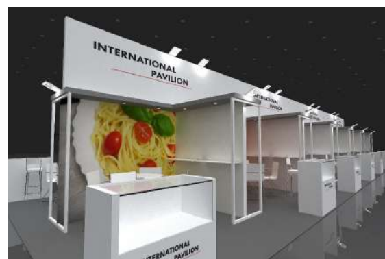
Illustrative image, 9sqm booth model.

The furniture used in the image is merely illustrative. Actual furniture used onsite may differ. Carpet applied directly over hall floor.