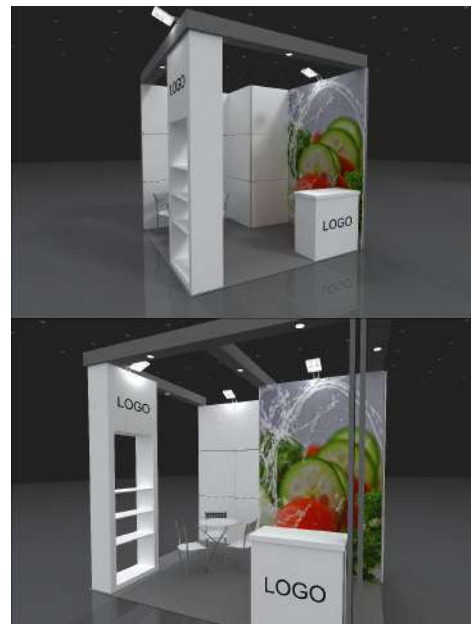
Illustrative images, 9sqm booth model.