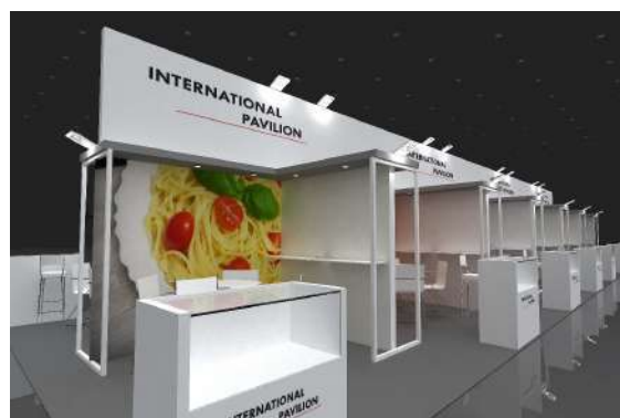
Illustrative image, 9sqm booth model.