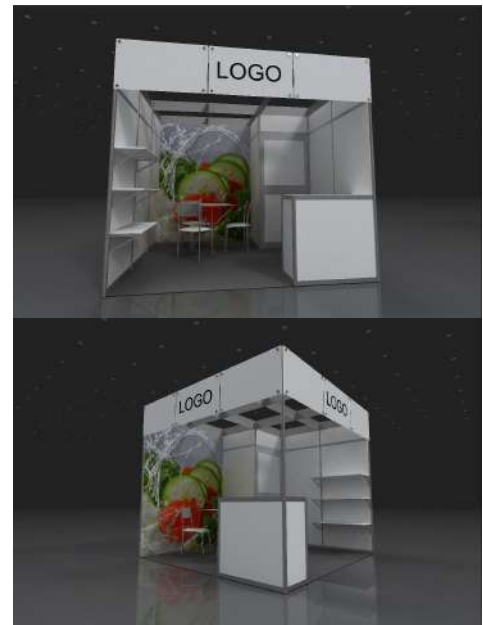
Illustrative images, 9sqm booth model.