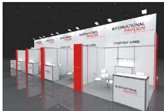
Illustrative image, 9sqm booth model.